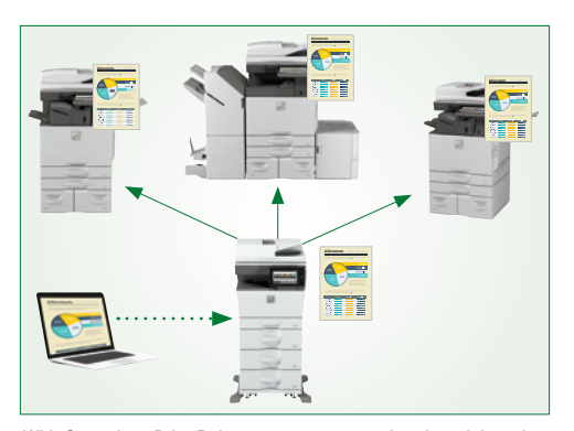
With Serverless Print Release you can securely print a job and release it from up to six Sharp MFPs (including host).