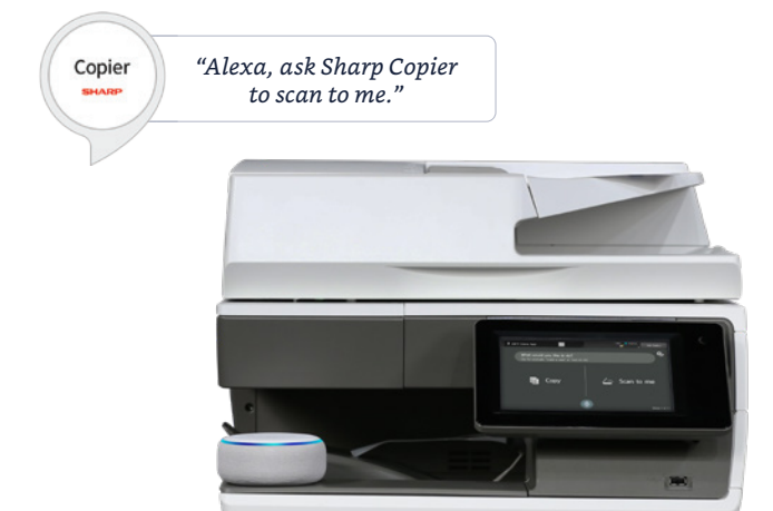
MX-C304W shown with available Sharp MFP Voice feature with Alexa.

Sharp has always been known for enhancing MFP productivity in the workplace by offering innovative, easy-to-use features. Sharp has done it again with the new MFP Voice feature available for color document systems. With Sharp's MFP Voice feature, you can interact with the machine just by using the power of natural language. With simple voice commands, you can ask the Sharp document system to make copies or scan a document.