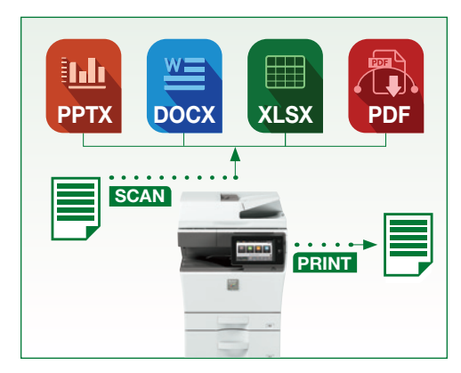
Scan and convert documents to popular file formats seamlessly with Sharp's built-in OCR function.