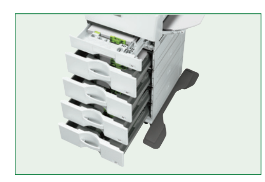
Both models offer up to six paper sources for a maximum 2,700-sheet capacity (shown with optional trays).