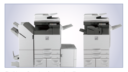
Flexible configurations for any size office.