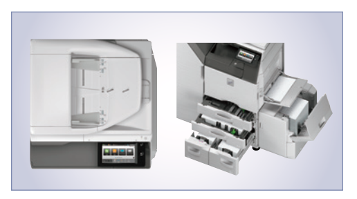
Easy-to-use, compact design.