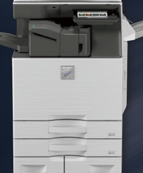
* Some features require optional equipment.