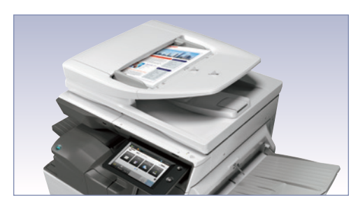
Standard 100-sheet reversing document feeder.