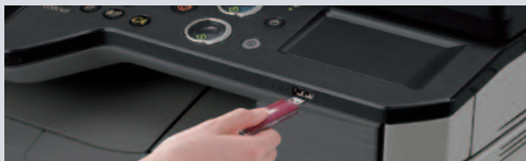
USB 2.0 port is located on the front panel for easy access*

Impressive workflow efficiency with leading edge features that help deliver optimum results.