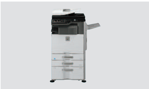
Available paper capacity stores up to a maximum of 3,100 sheets with options