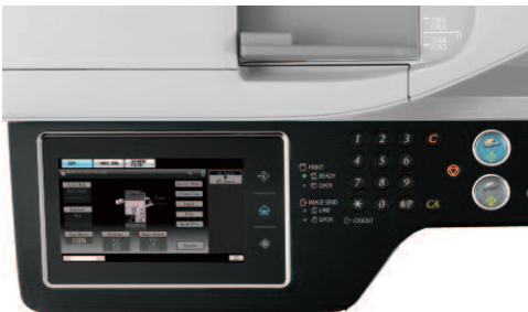
High-resolution touch screen with Stylus pen for easy point-and-touch operation