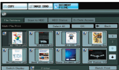
Sharp's easy-to-use Document Filing System with thumbnail preview